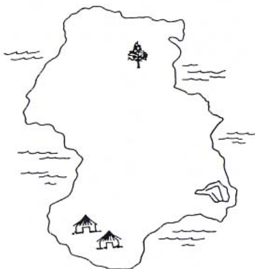
Figure 3.2: An island map.

These pairs of figures are similar to those used by Shepard and Xletzler (1971) in their study of the mental rotation of three-dimensional objects.